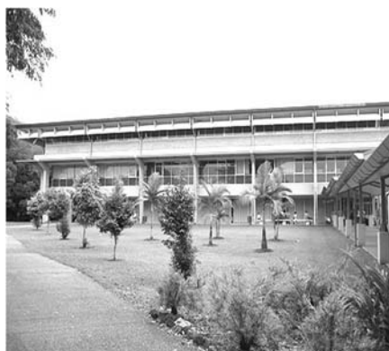
Library, Cairns Campus