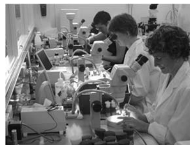
Research on Townsville Campus

HWS students will take four courses at JCU, chosen from an extensive range of subject areas within all or any of the sciences, with opportunities for electives in other areas of study. As a major research university known for its field and laboratory facilities, the curriculum serves students in the sciences particularly well (note: priority will be given to students whose academic needs can't be met in the Queensland, Australia program.) JCU is a large university and students will often enroll in classes that have 100-200 students. The faculty assume that students are independent learners and while they are accessible to students needing assistance, the onus is on the student to seek help when appropriate. Grading standards are rigorous and tend to weigh heavily on one or two exams rather than being distributed over a larger number of small assignments. For course information go to the CGE webpage for Townsville and Cairns http://www.hws.edu/academics/global/cairns.aspx and click on the courses link.