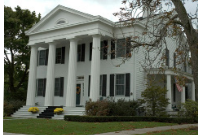
Gallagher House (1836) 690 South Main