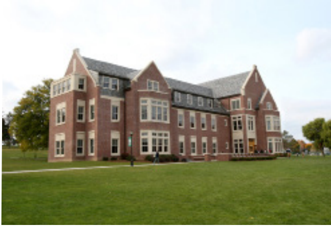
Stern Hall (2003) Pulteney Street