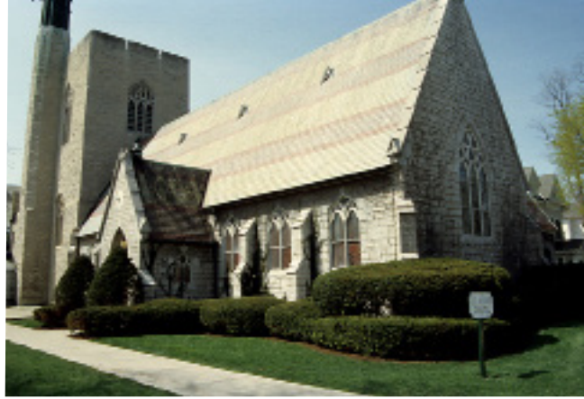
St. John's Chapel (1860-1863) 636 South Main