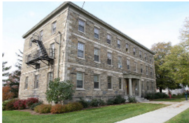
Geneva Hall (1821-1822) 648 South Main