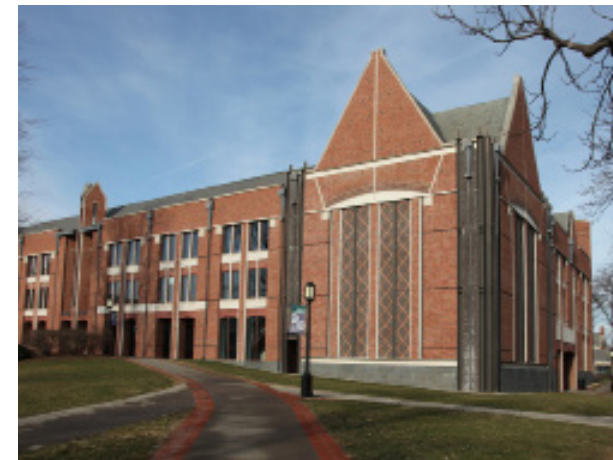
Warren Hunting Smith Library (1976) 330 Pulteney Street