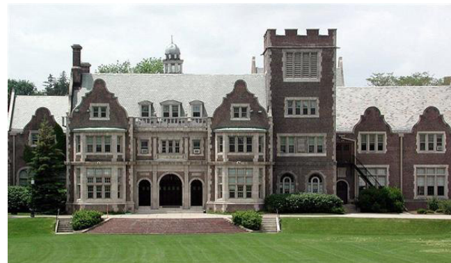
Coxe Hall (1901) 337 Pulteney