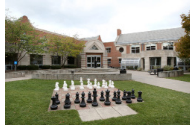
Scandling Center (1984) 300 Pulteney