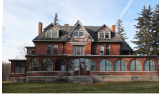
Houghton House (1880) 1 King's Lane