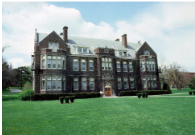
Smith Hall (1907) 352 Pulteney