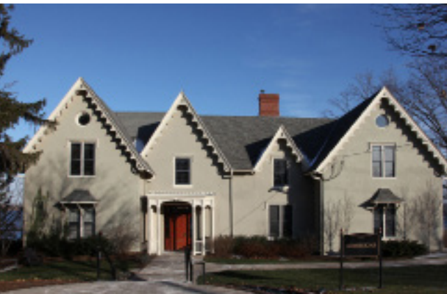
Bradford House (1840) 629 South Main