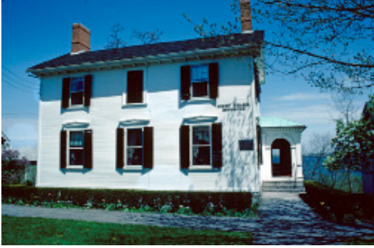
Durfee House (1787) 639 South Main