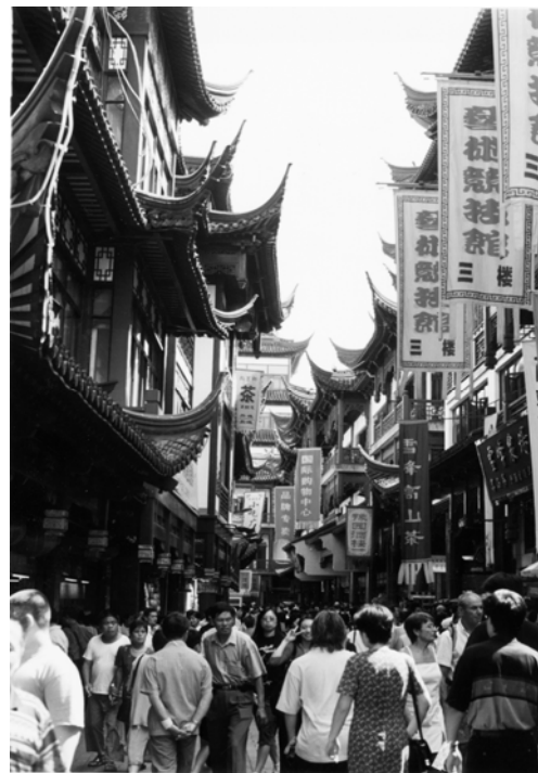
Chinese Street Scene

and a minimum of one year of college-level Mandarin Chinese or the equivalent and one Chinese area studies course for Nanjing and Taipei. Due to the challenging nature of study abroad, student academic and disciplinary records will be carefully screened.