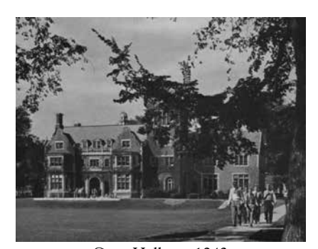
Coxe Hall, ca. 1942

Jackson, Potter and Rees Halls (J.P.R.), 1967