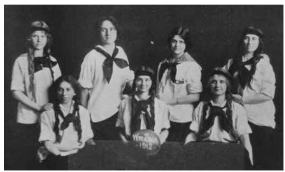
WS Basketball Team, 1912

From its very beginning, the College has been committed to empowering women and enriching their lives. The effect of that philosophy has been repeatedly demonstrated in many ways including the academic