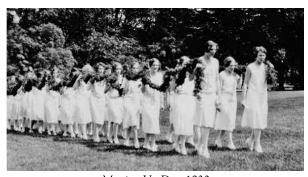
Moving Up Day, 1930

1930 - All College Day is instituted to mark the beginning of the Commencement week program and the end of the academic year. Activities