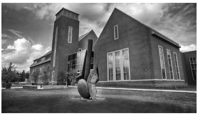
Gearan Center for the Performing Arts, 2016