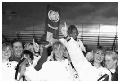
1988 Soccer NCAA Champions