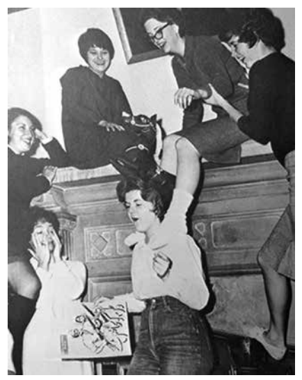
WS students, ca. 1963

The Charter Class established the big sister/little sister program in 1910 and with it the tradition of William Smith women reaching out and supporting one another. That tradition is continued today by a number of student organizations that help women make William Smith a vibrant and caring community. Organizations and programs that exist for the benefit of William Smith students include: