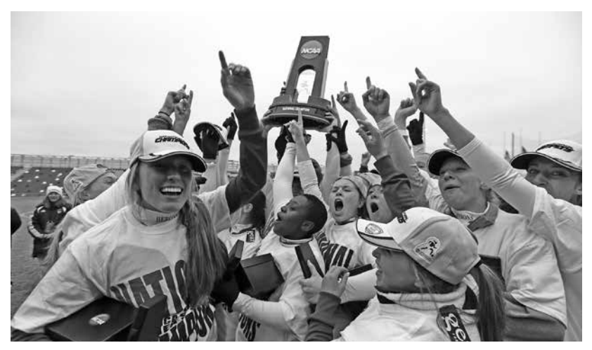
The Herons celebrating their 2013 NCAA Soccer Championship

Individual Athletic Honors (as of August 2021)