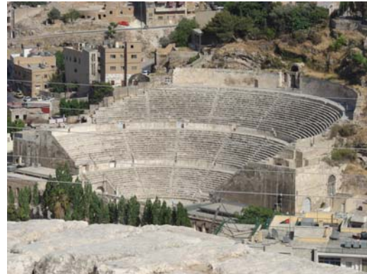
Ancient ruins rise amid the bustle of the modern city of Amman