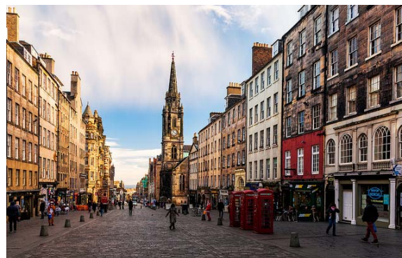
Edinburgh's Royal Mile

Historic Edinburgh is the capital city of Scotland and home to its Parliament. The city has a natural scenic setting and has been described as one of the most beautiful cities in Europe. Home to many historic buildings, the most famous attraction is Edinburgh Castle, drawing many visitors from around the world. This compact city of half a million is known for its hilly setting, history and tradition while also hosting a thriving contemporary arts and culture scene. The city hosts a number of international festivals, and its art galleries, unique shops, and restaurants that give it a very cosmopolitan flavor. It is also a university town, enrolling 100,000 students in many universities across the city.