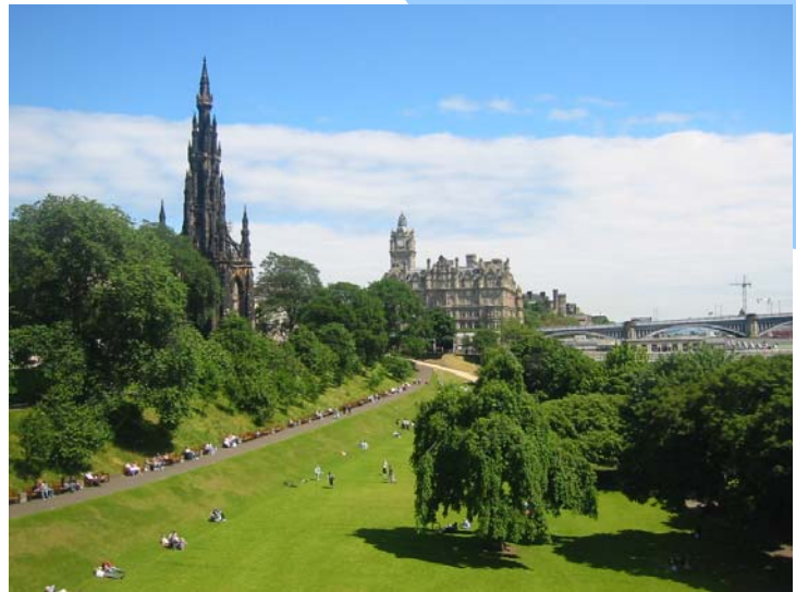
One of Edinburgh's many green spaces

ENU is not a “study abroad program” in the traditional sense in that HWS students will be directly enrolled at the university. While there will not be excursions designed specifically for HWS or study abroad students, ENU does plan some outings in and around Edinburgh for international students and there are student travel agencies nearby to assist those planning their own travel. In addition, the university has an extremely active student union which plans a variety of educational, cultural and travel opportunities to which all students are invited to participate (fees will vary). Independent and self-starting students will have a multitude of opportunities to immerse themselves in the local culture and to explore Edinburgh, Scotland and beyond.