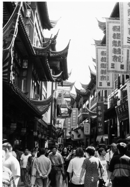
Chinese Street Scene

This program is open to sophomores, juniors and seniors in good social and academic standing who have a minimum GPA of 2.75. In addition, students must have completed, for any of the three locations, a minimum of two years of college-level Mandarin Chinese or the equivalent and one Chinese area studies course prior to participating in the program. Due to the challenging nature of study abroad, student academic and disciplinary records will be carefully screened.