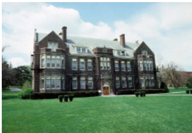
Smith Hall (1907) 352 Pulteney