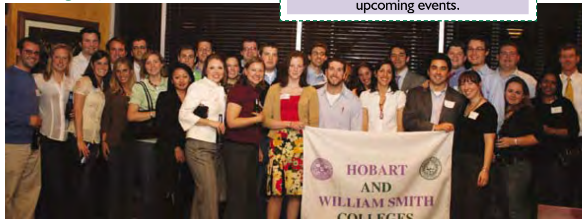
Photo op in our nation's capital! D.C.-area young alums meet during a happy hour in March.