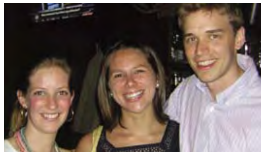
In May, young alums from the Big Apple gathered in the Mad Hatter Saloon for a happy hour to support The Fund for Hobart and William Smith.